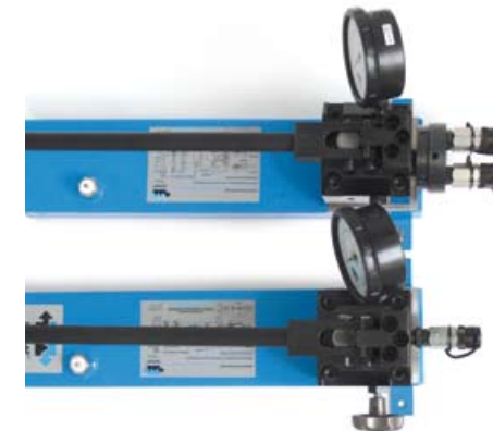
Example (top): HP 1600-1S with distributor disk and two outlets