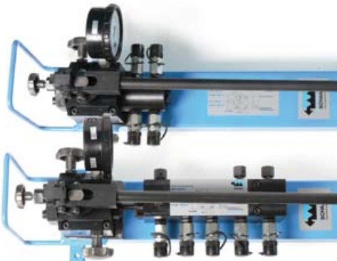
Example (top): HP 1600-2S with 4 outlets

Our highly-motivated staff would be pleased to train your personnel, in situ or at our works, in the general handling and operation of high-pressure equipment.