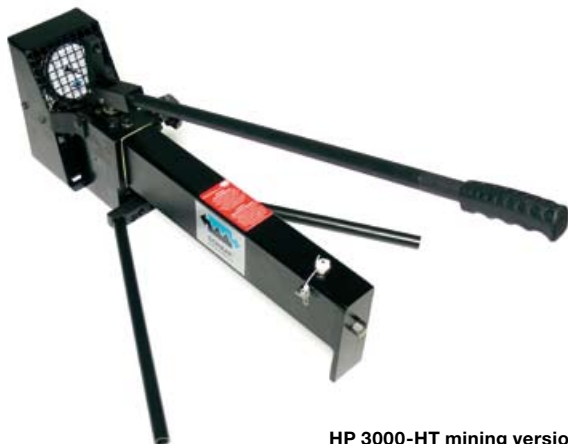
HP 3000-HT mining version

SCHAAF HP 3000-HT are user-friendly, reliable, and manufactured in accordance with the highest level of technical know-how. Our highly-motivated staff would be pleased to train your personnel, in situ or at our works, in the general handling and operation of high-pressure equipment.